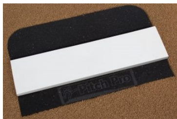
Pitch Pro Replacement Launch Pad