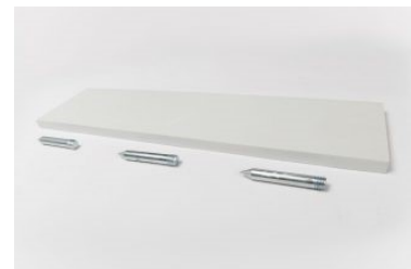
6" x 24" Replacement Pitchers Plate