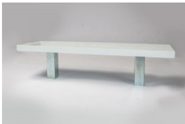
6" x 24" Replacement Drop-in Pitcher's Plate