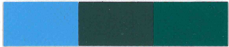
Marine Blue Forest Green Green*