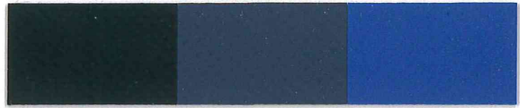
Black* Navy* True Blue