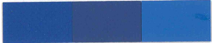
Regal Blue Royal Blue* Carolina Blue