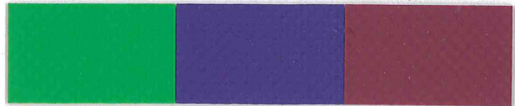
Lime Green Purple Maroon