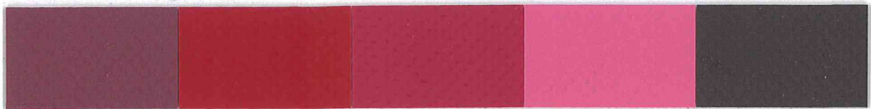
Burgundy Cardinal Red Red* Bright Pink Brown*