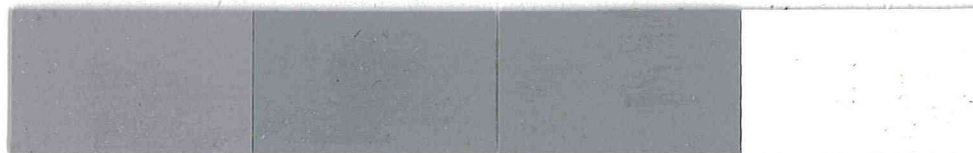
Grey* Steel Grey Light Grey White*